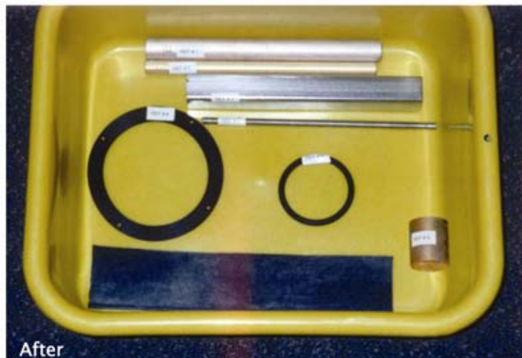
Samples after treatment.

There was no obvious change in weight, appearance, dimension or physical properties for any of the metal and rubber samples.