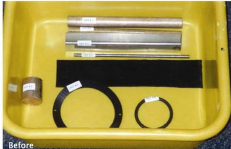
Samples before treatment.

The trial was conducted over 5 consecutive days using the same set of materials, immersed in a concentrated solution of both TRIPLE 7 Heavy Duty and EnviroScale.