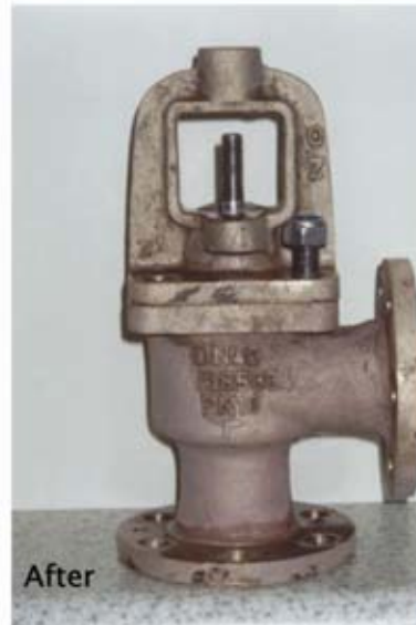
After agitation in TRIPLE 7 Heavy Duty and TRIPLE 7 Enviroscale baths.

For further information or technical advice on this product or any other in the Triple 7 range, please contact The water Professor at Coolabah Water Ph. 02 69 258 555