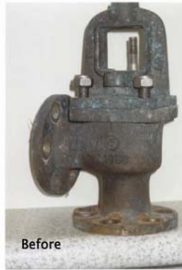
Original valves as received.